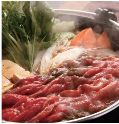
Halal Kobe Beef SUKIYAKI course