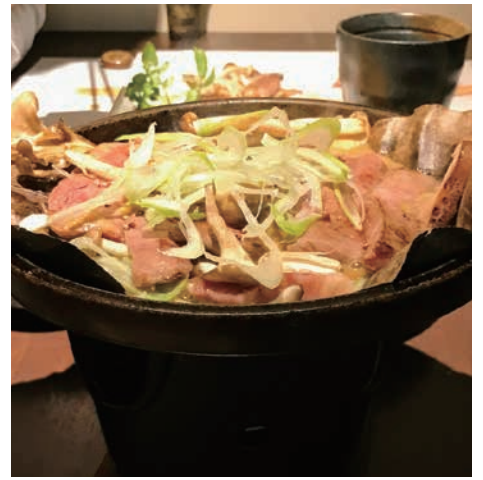
Halal Kobe Beef HOBAYAKI course