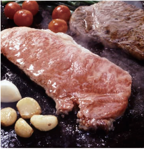
Halal Kobe Beef STEAK course